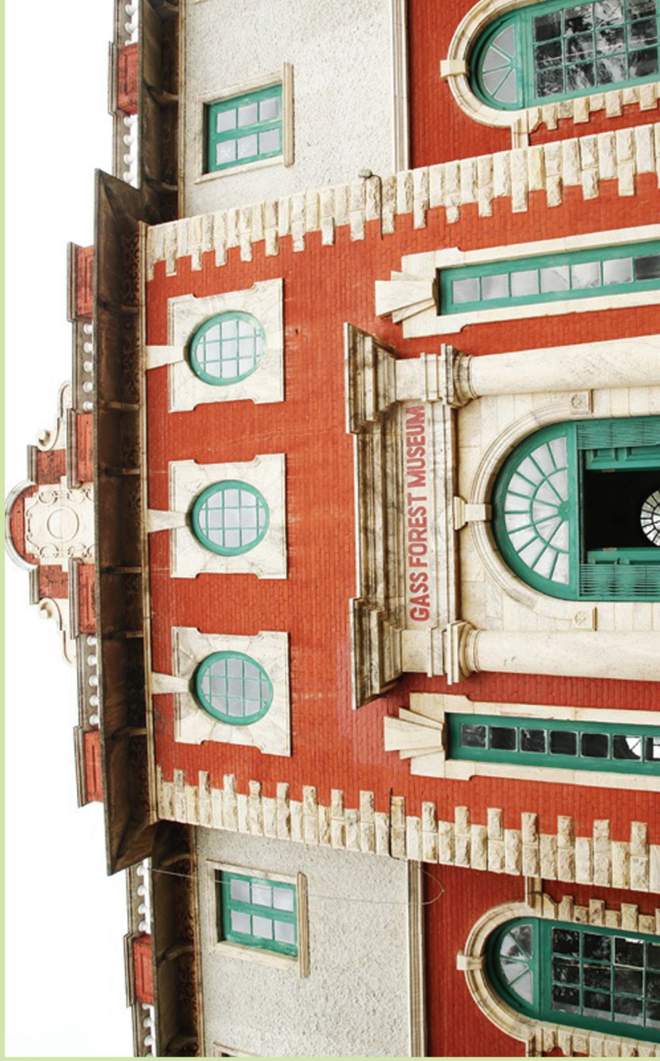
The Gas Forest Musium is located in Forest College, Coimbatore and established in 1902 by Mr. H.A. Gas,Conservator of Forest Coimbatore Circle.