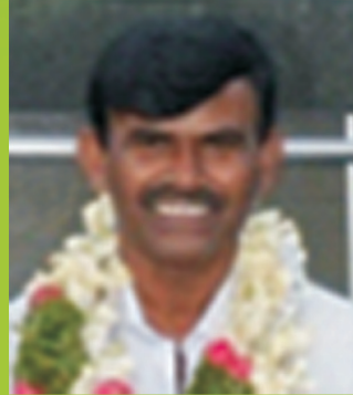
Papaiah, the Saviour